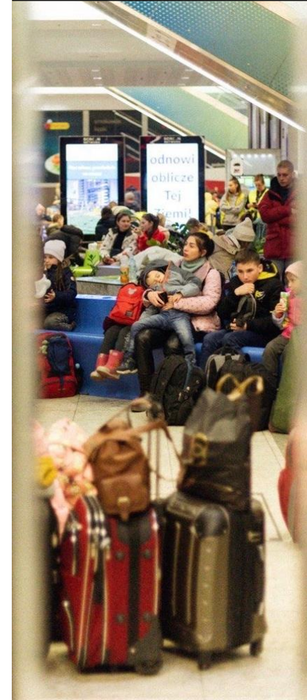
Train station with refugees waiting for directions for available refugee center

Our Life ministry in Charlotte, North Carolina, has been coordinating many volunteers traveling from the U.S. to Poland to serve in ministry outreach. Our ministry participates in preparing those volunteers for outreach events consisting of sharing the Good News, one-on-one or with groups, while providing different tools and training with the current team in Poland. The team we have in Poland helps to coordinate the arrival dates, lodging, and places of service for the volunteers willing to serve in Krakow.