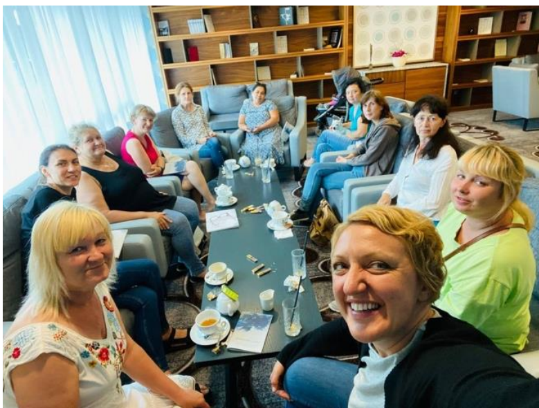
One of the ladies groups doing a Bible study

We currently have four Bible study groups that get together once a week in four different locations throughout Krakow. We meet at coffee shops and in homes in different areas—reading the Bible and discussing Biblical matters. After the events, we added 22 ladies to the four ongoing Bible study groups, which initially had about 15–20 people attending regularly (per group).