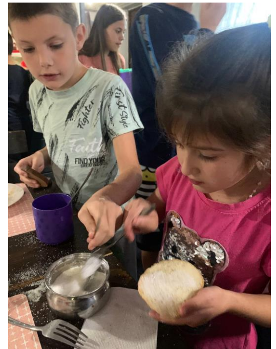
Kids would eat bread with sugar

On this trip we also helped kids from an orphanage by providing finances for food and medications and blankets. We provided different supplies for the people who are working with these kids so that they can effectively share the Good News with them. One of the temporary orphanages is in western Ukraine—as of right now there are 60 kids on standby and waiting for the government to provide their future stays/relocations.