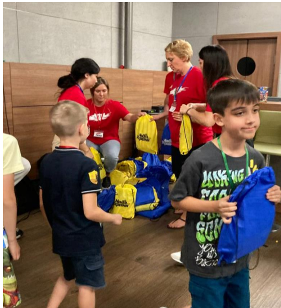
Handing out gifts and supplies to kids

On this trip we also helped kids from an orphanage by providing finances for food and medications and blankets. We provided different supplies for the people who are working with these kids so that they can effectively share the Good News with them. One of the temporary orphanages is in western Ukraine—as of right now there are 60 kids on standby and waiting for the government to provide their future stays/relocations.