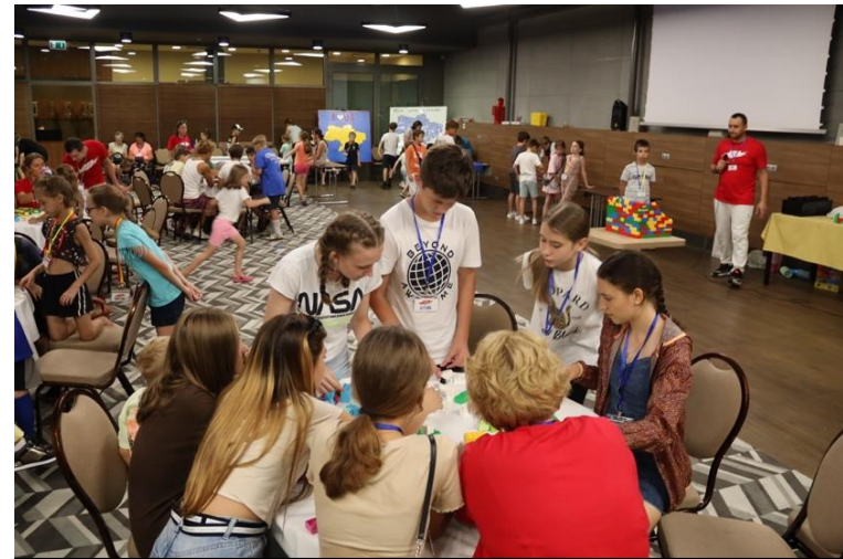
One of the photographs taken by our volunteer photographer

Another way we were able to effectively share God's love was with the photographer that took pictures during one of our events. One of the attendees at a LEGO event was a woman who was a professional photographer who decided to volunteer and take pictures of our event. After spending some time with us, she was so shocked in what she saw and she told us: "I thought that only old people believe in God and read the Bible, but now I see that the Bible and praying is very relative for young people. I am very impressed by it, and I am so interested to learn more."