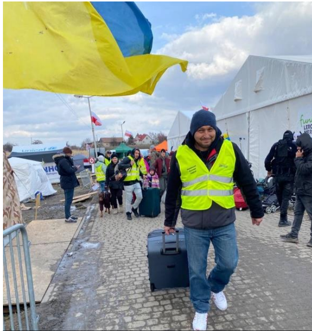
On the border of Ukraine

Growing deeper into service and grasping the need for service, we saw that we should continue reaching out and helping people due to the migration occurring throughout Europe. When refugees fled from Ukraine, they often first crossed over to Poland, and then after some time, meandered deeper into Europe, but then eventually ended up returning to Poland. As a result of this, there is a constant rotation of people filtering through Poland, especially Krakow, since it is not far from the border of Ukraine.