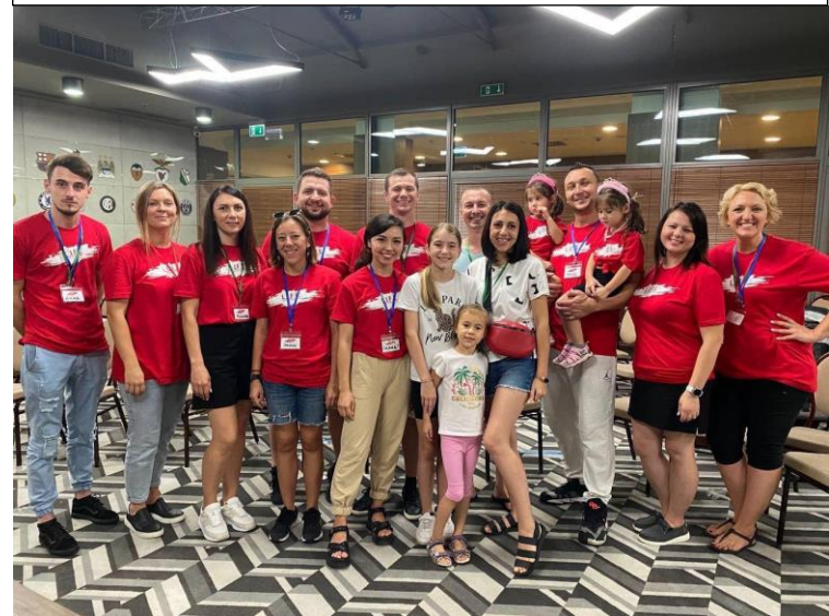
The team that helped serve at one of the refugee locations on our August trip to Krakow.

During the first several months following the start of the war, there was heavy traffic of people coming through Poland. Now, after seven months, there are quite a bit of people who have decided to stay in Krakow. By the grace of God, we have been able to stay in touch with some of these people and establish relationships with them.