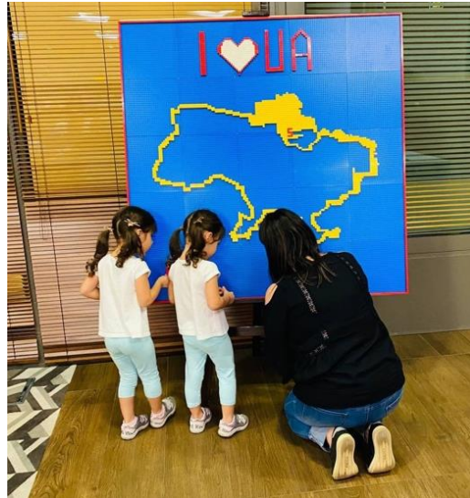
My family at one of the refugee centers in Krakow.

During the most recent trip to Poland, my family came as well. My kids were able to be a testimony and were able to participate in our outreach program. People would ask me why I chose to come to Poland and serve refugees with my family instead of using this time and money to go on vacation somewhere more enticing. This was a great testimony opportunity of God's love, and I shared what we came to do. Through this question, we were further able to share the Good News.