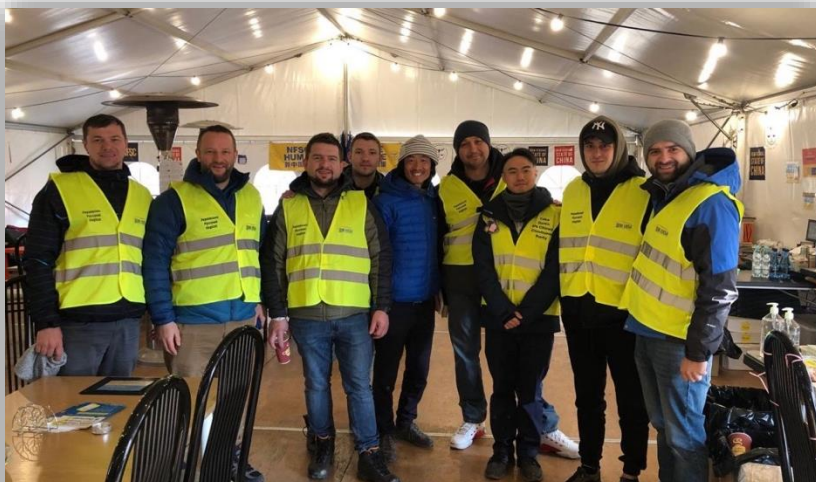
First trip to evaluate what was happening throughout the borders of Poland and Ukraine

Upon the start of the war in Ukraine, Life ministry reacted to the refugee crisis at the Ukrainian border from the city of Krakow, Poland. We planned our first trip to evaluate all that was going on and bring a message of hope to the people, as well as provide leadership training for the missionaries who had come to Poland. Following our departure, we started leading part of the outreach ministry currently going on for refugees in Krakow.